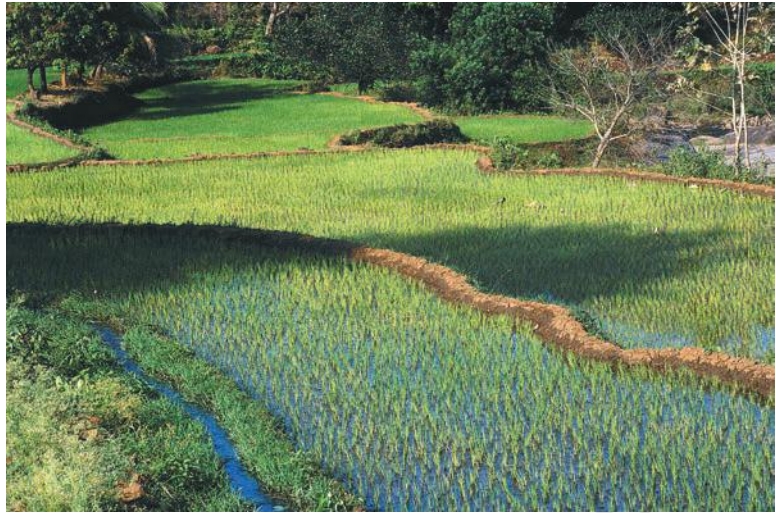
Transplanted paddy growing in a few of Ramalingam's 20 acres. A result of hard labour performed by agricultural workers like Thulasi.

This is when we can say they are caught in debt. In recent years this has become a major cause of distress among farmers. In some areas this has also resulted in many farmers committing suicide.