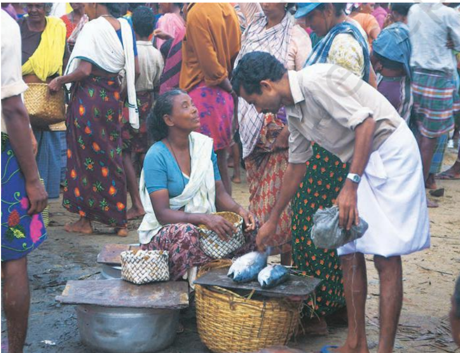
Fisher-woman selling the catch at the local market.