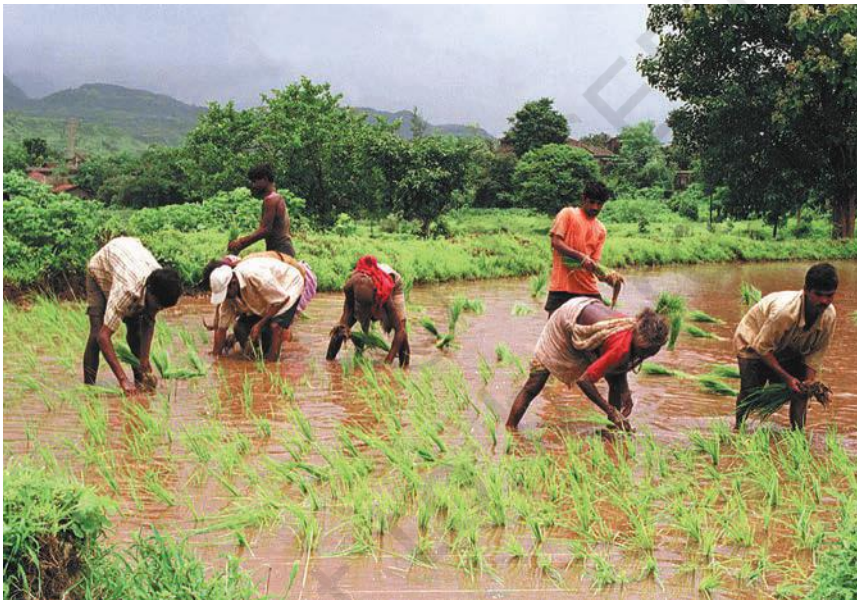
Transplanting paddy is back-breaking work.

The village is surrounded by low hills. Paddy is the main crop that is grown in irrigated lands. Most of the families earn a living through agriculture.